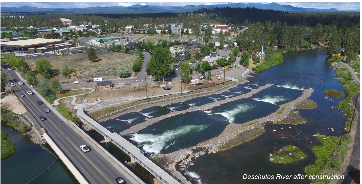
Deschutes River after construction

The Bend Parks and Recreation District pursued a whitewater park to replace the hazardous 9-ft Colorado Dam on the Deschutes River. Following initial feasibility analysis, BPRD soon recognized that the project was not only a whitewater park, but a river project with sensitive aquatic species, dam stabilization issues and fish and boat passage concerns. RiverRestoration was retained in 2010 to develop realistic and practical solutions to these issues. Our philosophy of looking at river system function, combined with our rigorous and analytical design of whitewater features was the recipe for success on the Deschutes River. RiverRestoration quickly identified improvements to the concept for benefits to whitewater, passage and habitat. RiverRestoration provided the river engineering required for the success of the Colorado Dam Paddle Trails Improvements including 3D CFD design of unique features for river surfing and kayaking. The recreational experience was negotiated and communicated with stakeholders throughout the design process. The project construction was completed in February 2016 and has become a key recreational asset for the community for all types of river users.