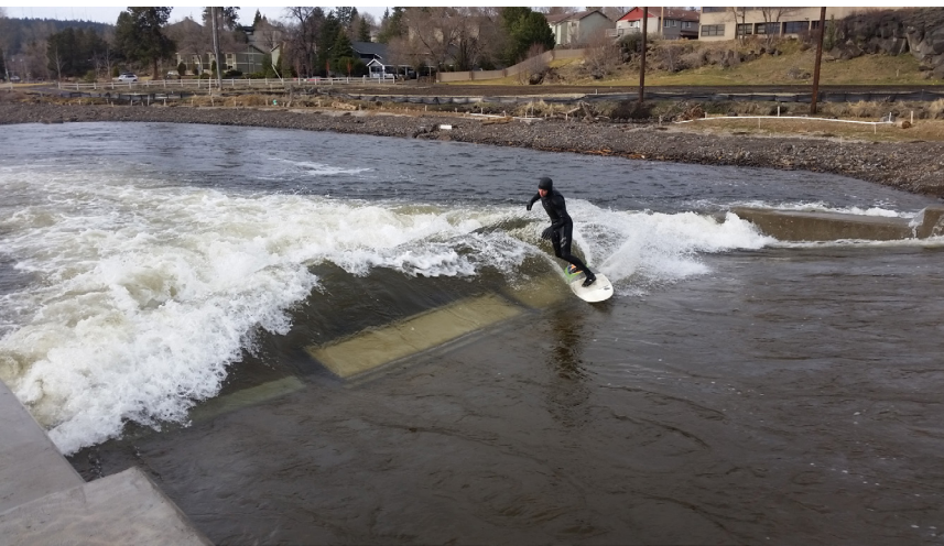
River surfing Drop 3 final product

PASSAGE CHANNEL: Accommodations for river users and fish to navigate the Deschutes River through Bend, Oregon