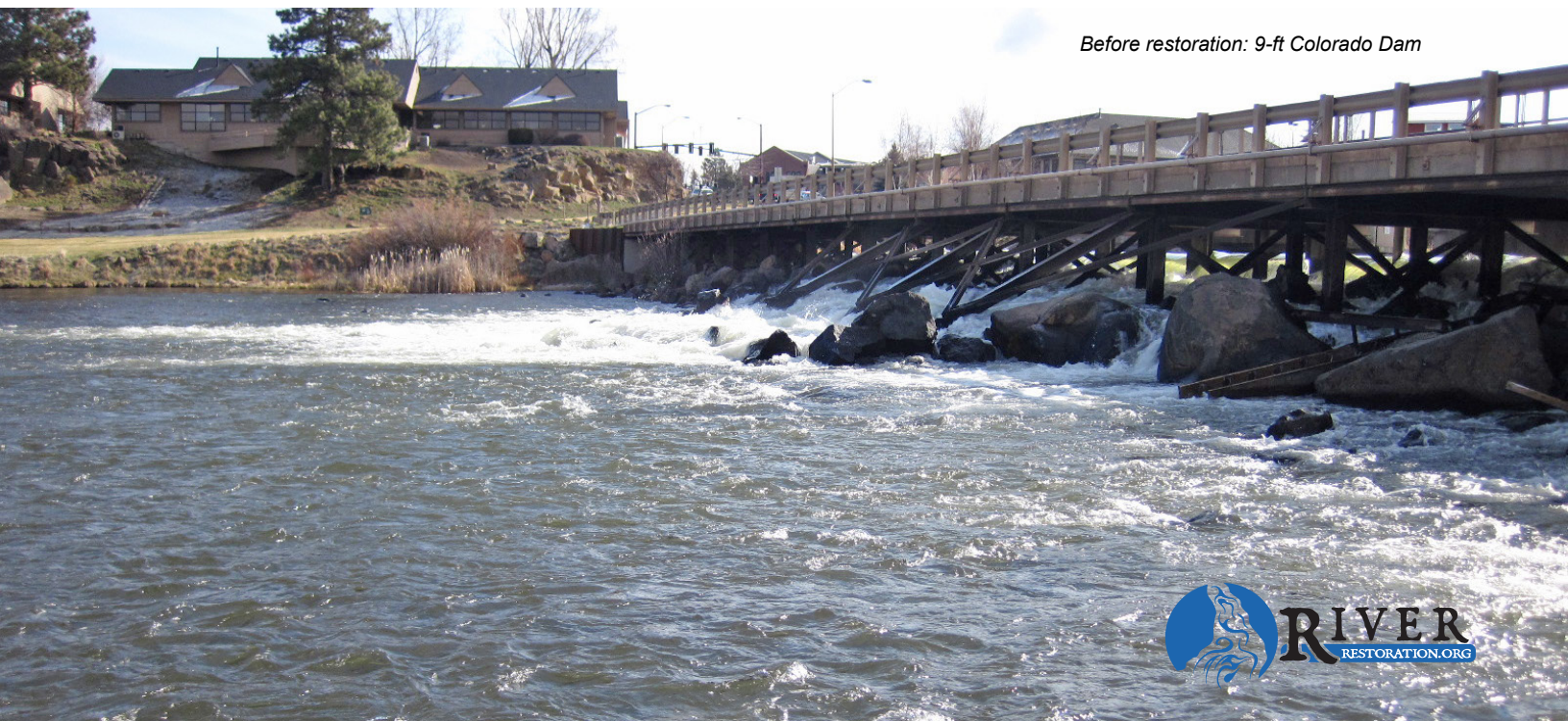
Before restoration: 9-ft Colorado Dam