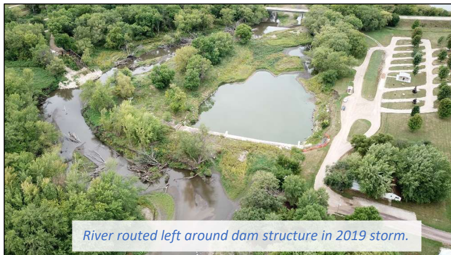
River routed left around dam structure in 2019 storm.