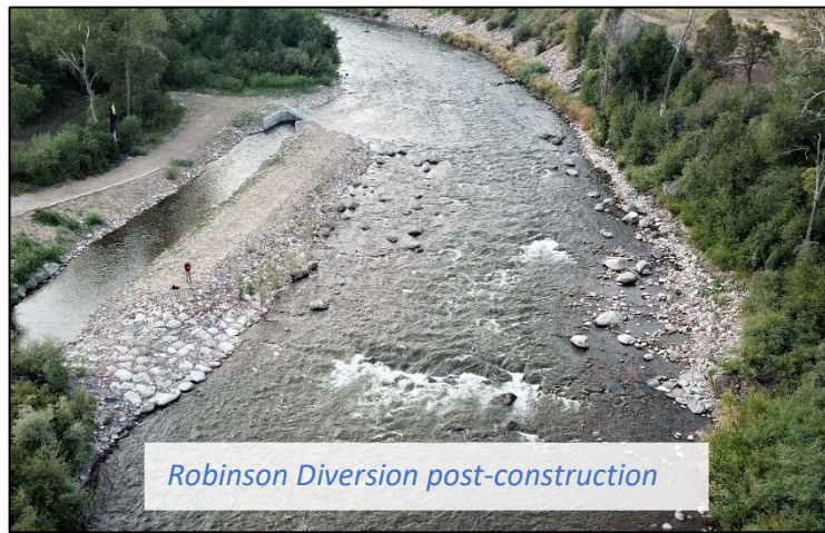
Robinson Diversion post-construction