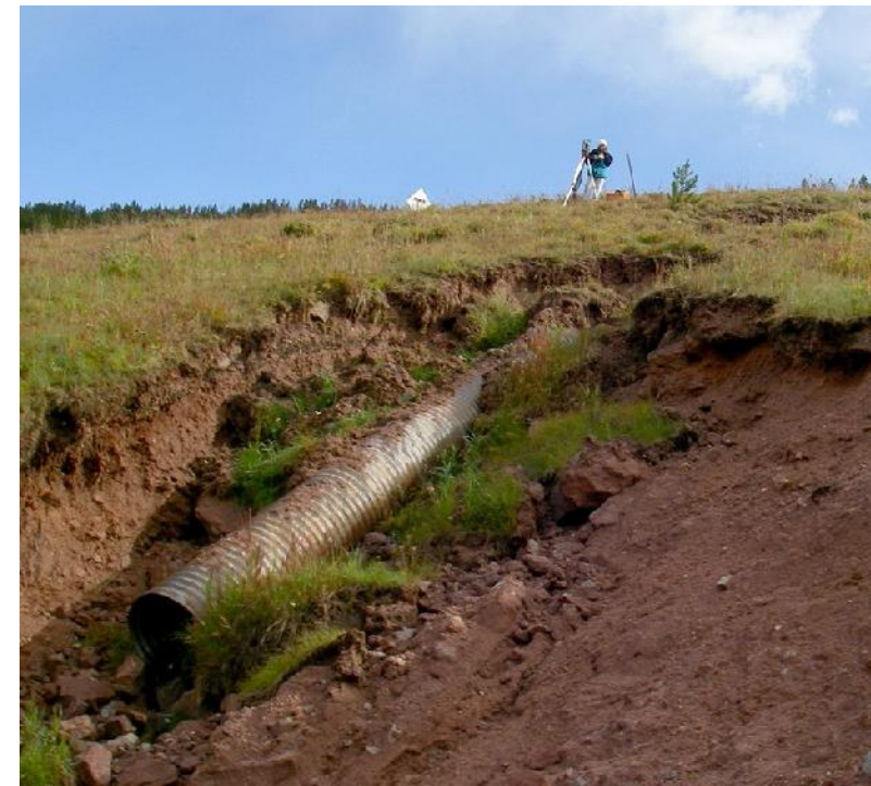
Failing fill slope culvert

Location: Black Gore Creek of the Eagle River Watershed