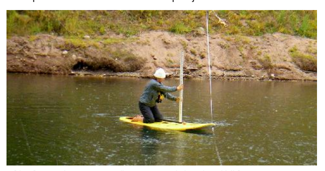
RiverRestoration surveys sediment accumulation along Vail Pass

In 2004, RiverRestoration was retained by the Eagle River Watershed Council to assist with the development of a TMDL that would move the creek off the impaired waters list. The Black Gore Creek Steering Committee needed new ideas for watershed restoration and to create a TMDL that would build consensus among stakeholders as well as identify implementable action. Coordinating with the US Forest Service, Colorado Department Of Transportation, CO Dept of Health and Environment and local governments, RiverRestoration identified the water quality impairments, defined stream health targets, and led the authorship of the TMDL. In addition, RiverRestoration developed and implemented an annual Sediment Source Monitoring plan; established the capacity of the creek to assimilate sediment; furthermore, RiverRestoration created calculations for annual "Sediment Budget" and "Load Allocation" that informs basin management and prioritizes stabilization projects.