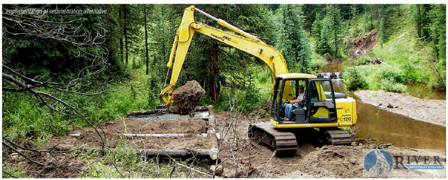
Black Gore Creek TMDI

RiverRestoration bi-annually identifies prioritizes and engineers restoration projects within Black Gore Creek. Efforts include sediment source stabilization, channel restoration, and watershed health improvement. A monitoring plan for both environmental targets and sediment sources was developed. Annual monitoring is used to track sediment loading conditions and gauge the delayed watershed response to changes in highway maintenance practices and implemented watershed restoration projects. Monitoring data is then prepared in an annual best management practice and adaptive management recommendations report. These recommendations can be used for adjusting current practices, modifying existing projects, or prioritizing future improvement projects. RiverRestoration recommendations have included innovative techniques and creative solutions for reducing the impact of sediment on the watershed such as sand wanding, sediment basins, log cribbings, stormwater improvements, and biostabilization. Ongoing monitoring is showing that the approach is working and the environmental targets are responding favorably.